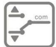
Dry connect port