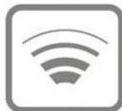
Built-in wireless receiver